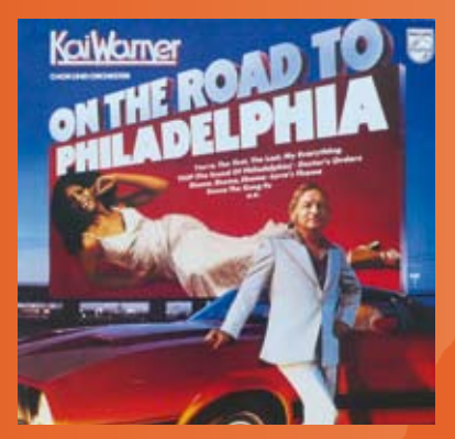
All the pseudonyms and Philly flashes on the block cannot disguise the fact that Kai Warner is a Last through and through (Track 5)